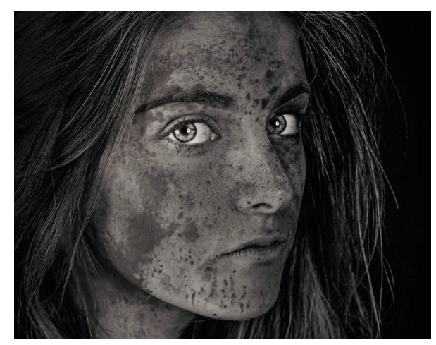
Fire Chief's Daughter" Digital Photo by Grace Prachtauser

The results of the 2018 Morris County Teen Arts Festival made it clear: the arts – and artists – are thriving at MHS and FMS.