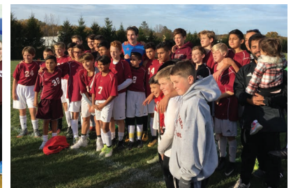
FMS Girls captured the Morris County Middle School Basketball Championship and the Boys Soccer team brought home its own County Championship title trophy!