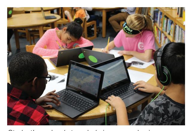
Student's are hard at-work during an academic after-school session.

Last spring, the Morris School District received a generous major grant from the Provident Bank Foundation through the Morris Educational Foundation for the creation of new Academic Support Centers for K-5 students. This spring, students enrolled in the Academic After-School programs show increases in classroom and benchmark performance.