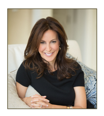
PRESENTATION • Q&A SESSION BOOK SIGNING*

Psychiatrist, Parenting Expert & Author: Permission to Parent: How to Raise Your Child with Love and Limits.