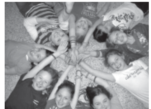
Thomas Jefferson students show off their Character Counts bracelets.