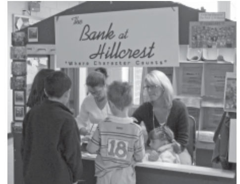
Hillcrest School: Parent volunteers help students deposit coins into their accounts under the Coins for Character program.