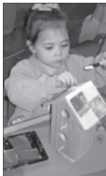
Children at the Lafayette Learning Center, working busily at decorating their birdhouses and clay tiles.