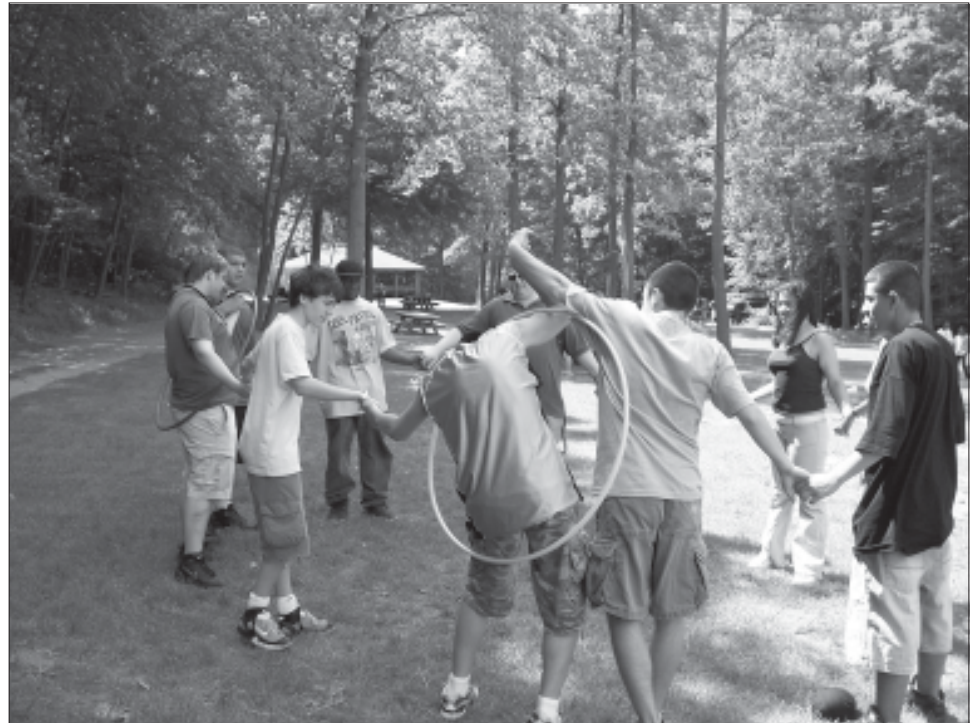
MHS Special Education students experience Team Building, June 2006.