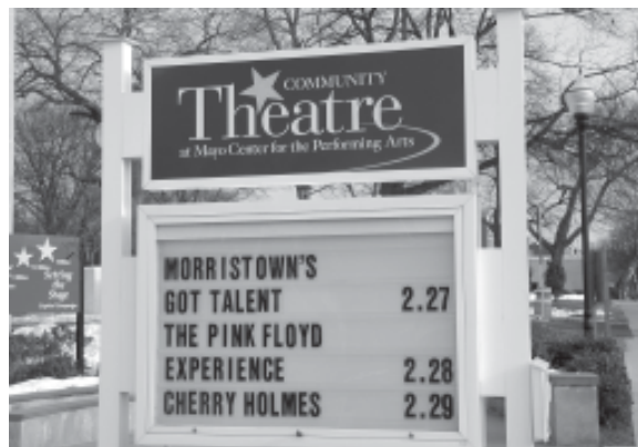
(Photo to the left) Marquee from The Community Theatre highlighting the Morristown's Got Talent show.