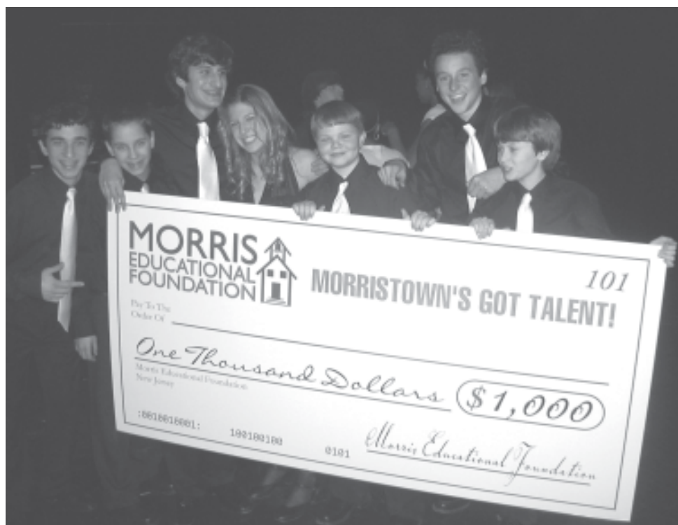
Members of Timeless Jazz holding their first place check. Their rendition of Fats Waller’s “ Ain’t Misbehaving ” took the audience back in time and won the group first place in the MEF talent show, “ Morristown’s Got Talent! ”

The show was the first of what the Morris Educational Foundation plans to be an annual event. “We are proud to give our local amateur community an opportunity to showcase their talents in front of their hometown and in a top notch facility such as The Community (continued on page 3)